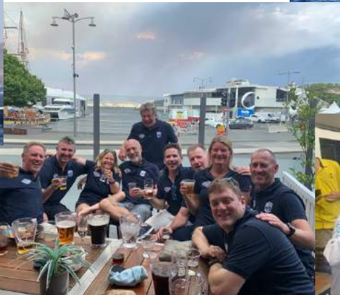
Enigma crew enjoying a quiet little drink