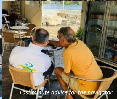
Last minute advice for the navigator