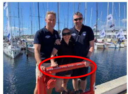
Commodore & Rear Commodore trying to rattle my cage ;)