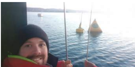
Dare Devil crosses the finish line