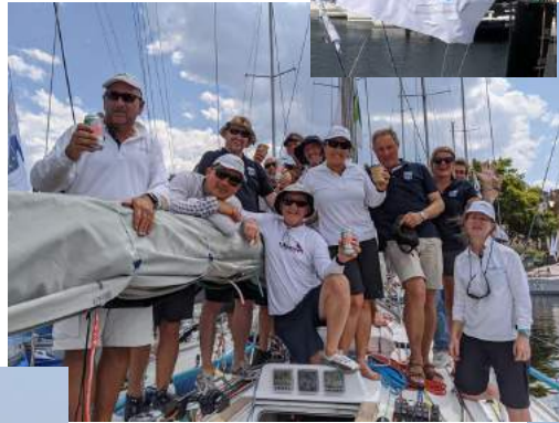
Copernicus & Enigma crew