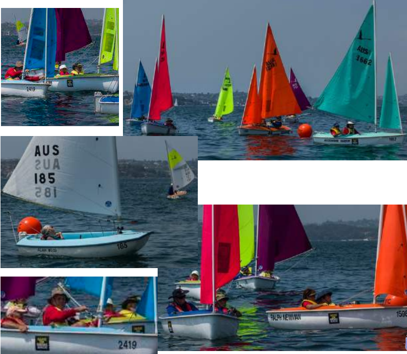
NYE images by Eli