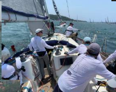
... and out the heads they go