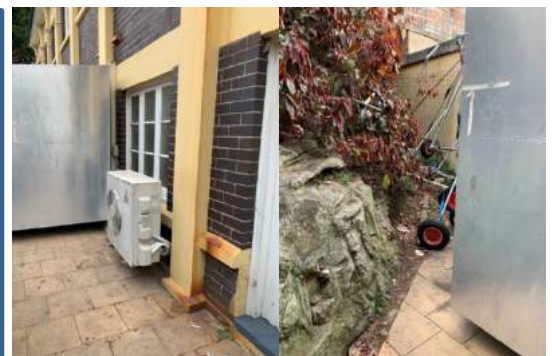
Air con has been moved giving a little more space for the laser dollies