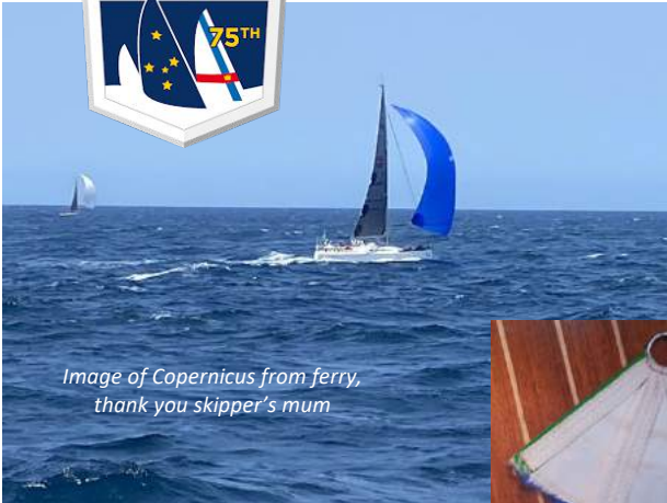
Image of Copernicus from ferry, thank you skipper's mum