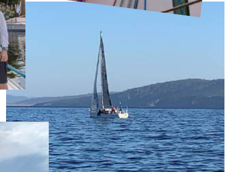
Copernicus from Enigma