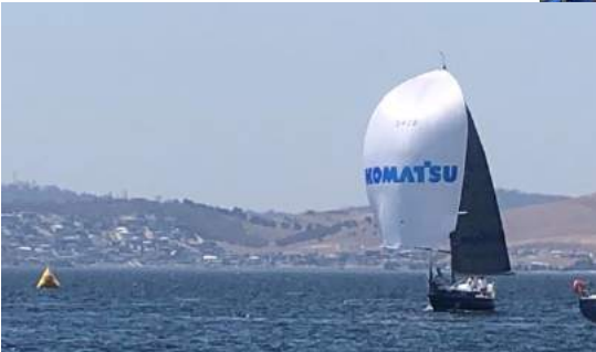
Azzurro crosses the finish line