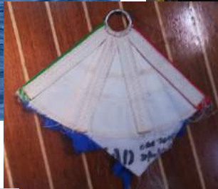
Oops! the blue kite is no more... pushed it just a little too hard on the first night