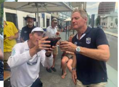
Enigma first in ... Copernicus owes the jug of rum!