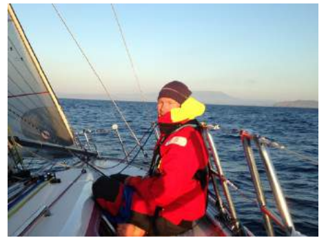
Skipper banished to foredeck??