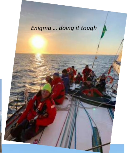
Enigma ... doing it tough