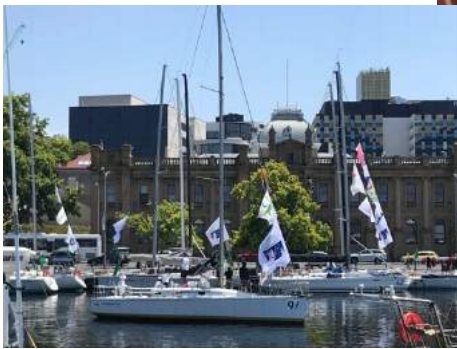
Copernicus arrives at Constitution Dock